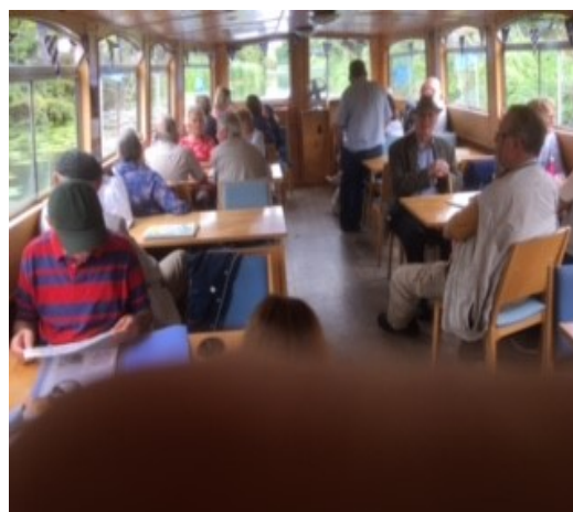
On the boat

The Canal trip lasted one hour and a quarter from the Chichester Canal Basin to Hunstan and back