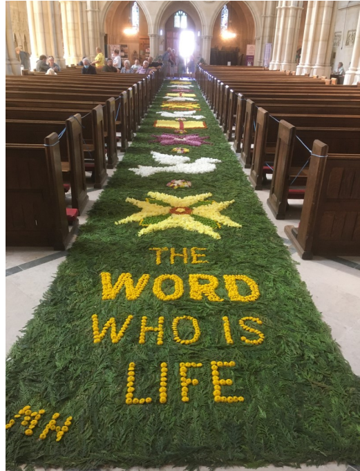
The carpet of Flowers at Arundel Cathedral in June, also showing the Shrine of St Philip Howard which was this year specially decorated by the Knights of the Holy Sepulchre who stood guard throughout the festival.