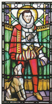
ST PHILIP HOWARD